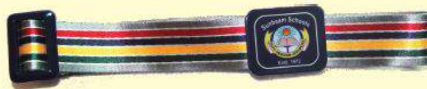
Belt (classes VI - XII)

NOTE Parents are free to buy Uniform / Accessories / Shoes from any shop / outlet of their convenience from anywhere in the city.