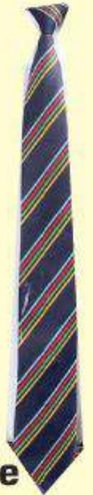
Tie (classes VI - XII)