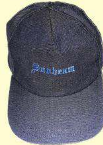
Cap (Nursery to Class XII) to be worn during extreme summer and whenever students go for field trips and learning expeditions.