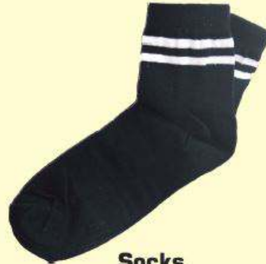
Socks (Nursery to Class XII)